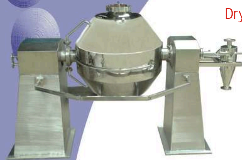
Rotary Vacuum Dryer