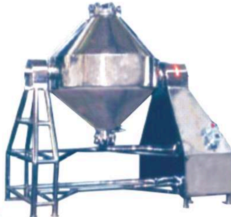
Double Cone Blender