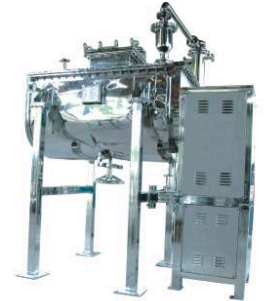
Ribbon Type U Shape Dryer